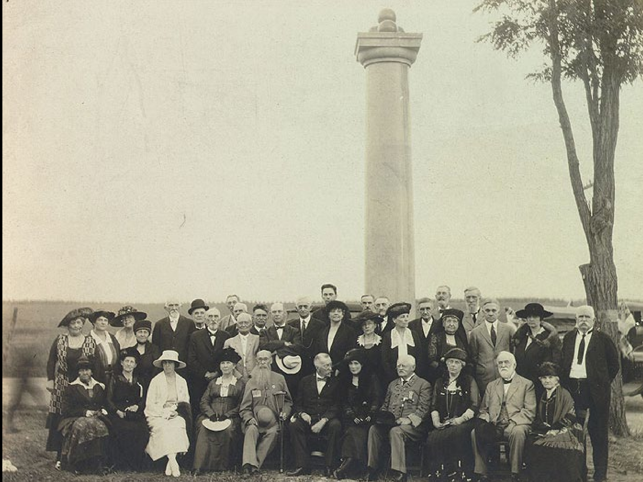
Image at right: The dedication of the monument to Confederate Gen. Stephen Dodson Ramseur on the Cedar Creek battlefield on September 16, 1920. Ramseur was mortally wounded during the later stages of the Battle of Cedar Creek and died in the Belle Grove Manor House the next day.