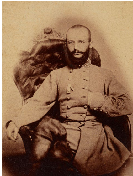
Confederate Gen. Stephen D. Ramseur, who was mortally wounded during the battle